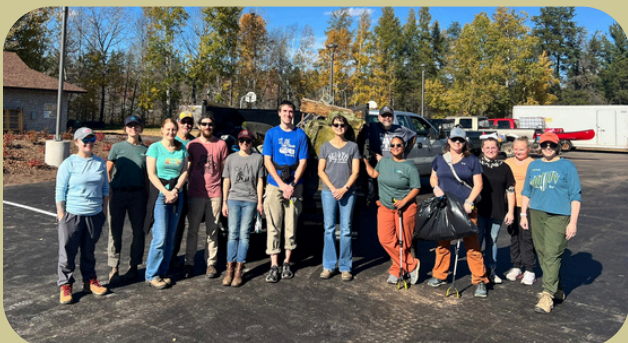
Volunteers at Little Trout Lake Park

We have beefed up security, including lights and cameras, but you are the best measure of security. Please report any suspicious or illegal activity right away by calling 911.